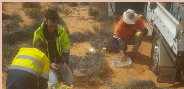
Survey staff preparing bait tubes for camera installation