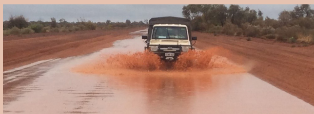
Flooded conditions, encountered twice during field surveys