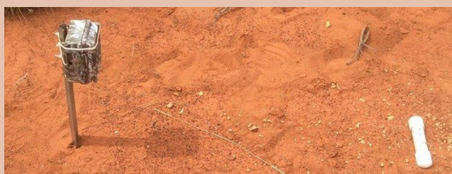
An example of a motion sensor camera and bait installation