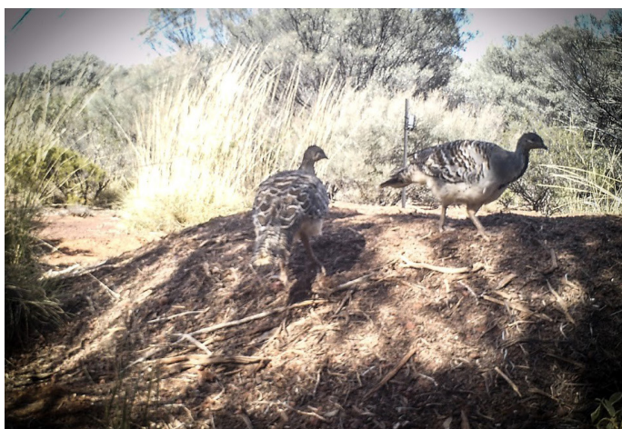
Nganamara (Malleefowl) building a nesting mound.

The Adaptive Management Implementation Plan was completed. Rangelands NRM will continue to facilitate catch up meetings with the Adaptive Management Partners (Spinifex Land Management, Yilka Aboriginal Corporation, Central Desert Native Title Services, Rangelands NRM, Greening Australia, the Trust, Conservation Management and the Department of Biodiversity, Conservation and Attractions) to develop and implement the projects recommended in the plan.