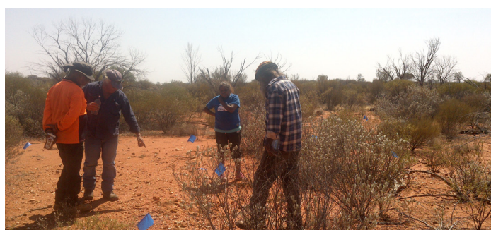
Undertaking a heritage survey