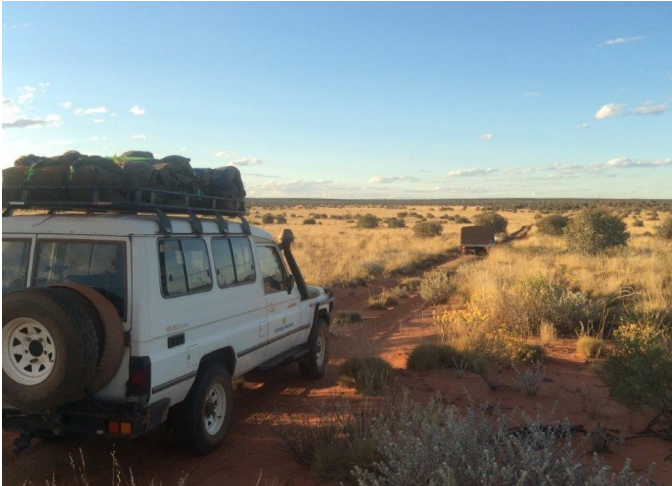
The Survey team traversing Stackman Track in October 2017

A Greening Australia field team has recently returned from the incredibly vast and remote Great Victoria Desert (GVD) where they have been undertaking surveys to detect the threatened Sandhill Dunnart.