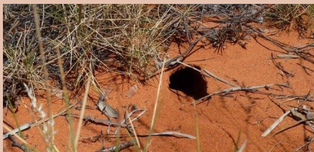
A possible Sandhill Dunnart burrow observed at the foot of an unburnt sand hill