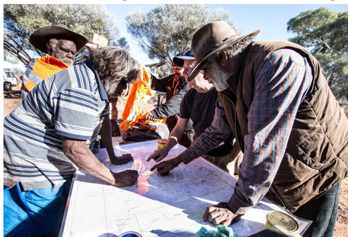
Pre flight planning which sites will be visited.

Spinifex Land Management (SLM) Rangers located in the heart of the Great Victoria Desert have been doing a lot of work and it is being recognised!