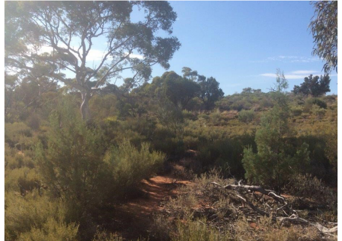
Unburnt sand hills likely habitat for Sandhill Dunnarts

In Western Australia, there is little understanding about the ecology, biology and habitat requirements of the Sandhill Dunnart, and the influence of threatening processes on the species.