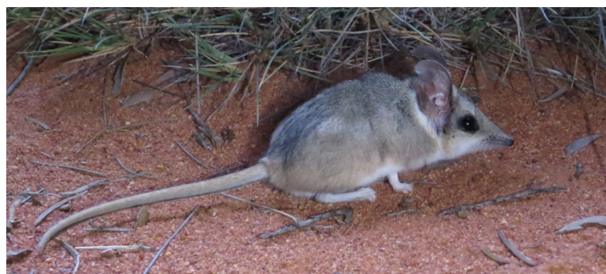
A Sandhill Dunnart.

I've also been liaising with the Technical Advisory Panel about future projects, communicating with Rangelands NRM, organising presentations and meetings and had networking and learning opportunities at the recent Indigenous Desert Alliance Workshop.