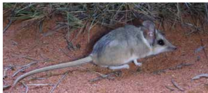
A Sandhill Dunnart.

I've also been liaising with the Technical Advisory Panel about future projects, communicating with Rangelands NRM, organising presentations and meetings and had networking and learning opportunities at the recent Indigenous Desert Alliance Workshop.