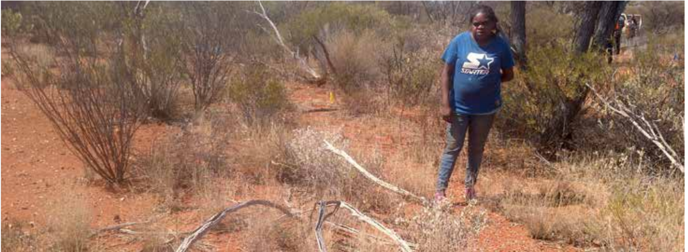
Chelsea Westlake with a newly found wiltja (shelter)

Yilka, situated on the western edge of the Great Victoria Desert, is one of Western Australia's most recently determined Native Title areas.