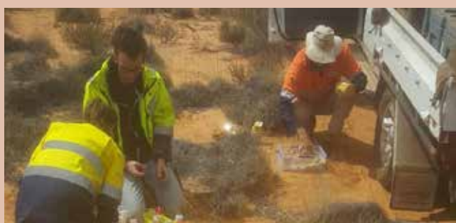
Survey staff preparing bait tubes for camera installation