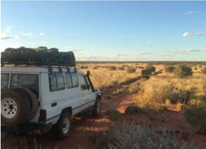
The Survey team traversing Stackman Track in October 2017

A Greening Australia field team has recently returned from the incredibly vast and remote Great Victoria Desert (GVD) where they have been undertaking surveys to detect the threatened Sandhill Dunnart.