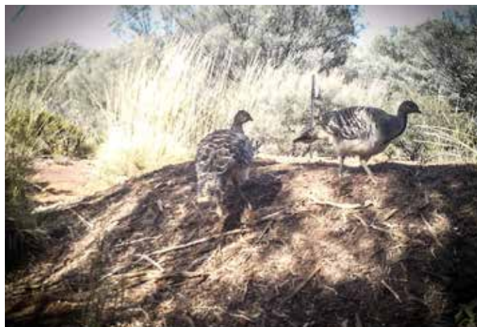
Nganamara (Malleefowl) building a nesting mound.

The Adaptive Management Implementation Plan was completed. Rangelands NRM will continue to facilitate catch up meetings with the Adaptive Management Partners (Spinifex Land Management, Yilka Aboriginal Corporation, Central Desert Native Title Services, Rangelands NRM, Greening Australia, the Trust, Conservation Management and the Department of Biodiversity, Conservation and Attractions) to develop and implement the projects recommended in the plan.