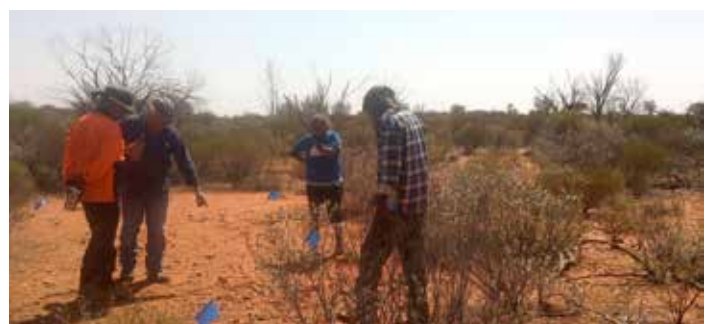
Undertaking a heritage survey