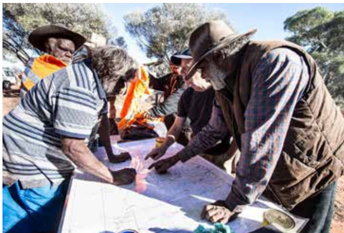
Pre flight planning which sites will be visited.

Spinifex Land Management (SLM) Rangers located in the heart of the Great Victoria Desert have been doing a lot of work and it is being recognised!