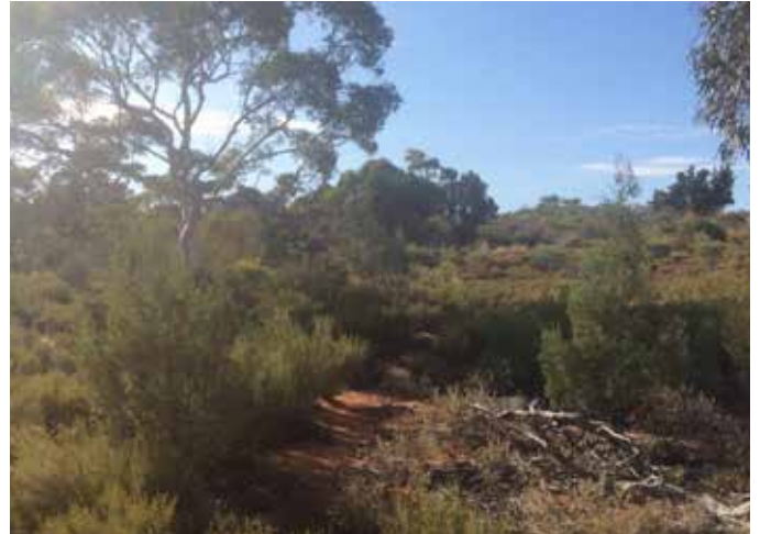
Unburnt sand hills likely habitat for Sandhill Dunnarts

In Western Australia, there is little understanding about the ecology, biology and habitat requirements of the Sandhill Dunnart, and the influence of threatening processes on the species.