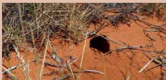
A possible Sandhill Dunnart burrow observed at the foot of an unburnt sand hill