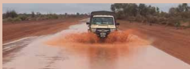
Flooded conditions, encountered twice during field surveys